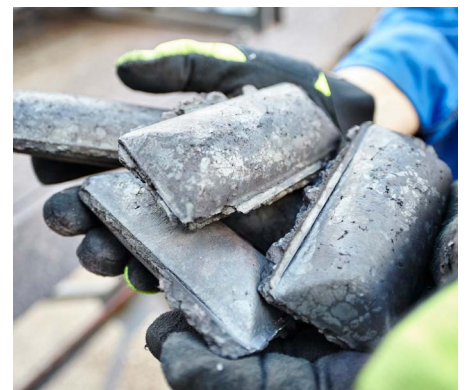
Hot Briquetted Iron (HBI)

Under these circumstances, some increase in hot metal feedstock cost due to addition of HBI to the BF burden can be justified on the basis of increased steel production, higher BF productivity, reduced coke consumption, etc. HBI specifications for BF use can be less stringent than for EAF steelmaking since higher levels of silica, iron oxides and sulphur and lower metallization can be tolerated in the BF.